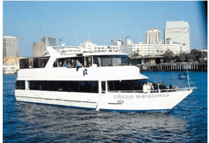
See you on this yacht Saturday, 29 th July